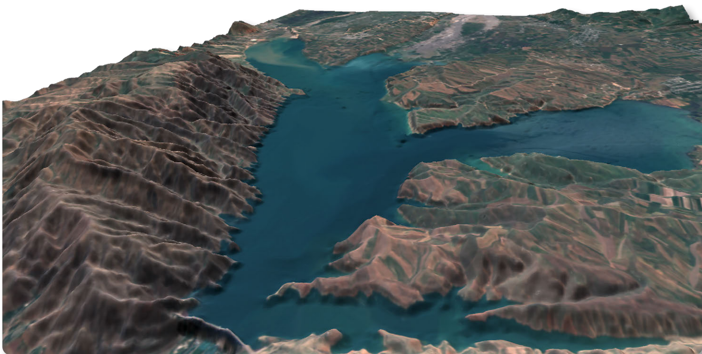
Andijan Reservoir, Uzbekistan